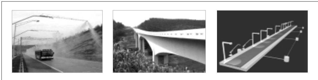
1. Smart Road ( , , )